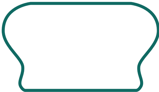
911 TOP RAIL W 2-7/8" x H 1-5/8"

Custom wood species may be provided upon request, dependent on availability.