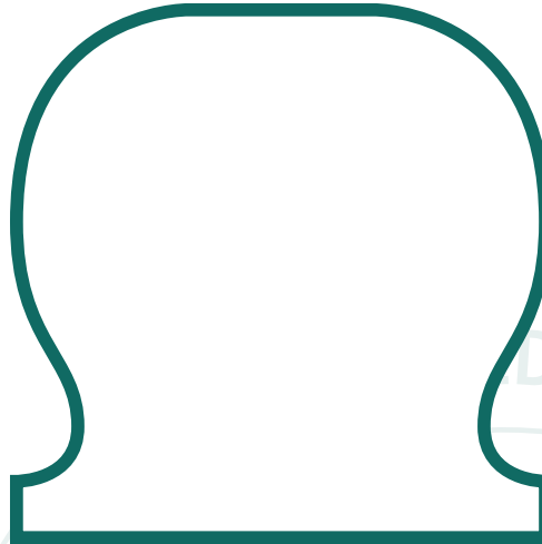
CUSTOM LARGE MUSHROOM RAIL W 2-1/2" x H 2-3/4"