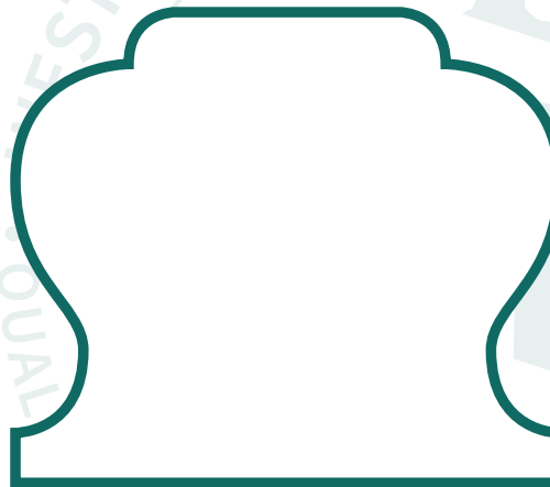
925 LARGE CROWN RAIL W 2-7/8" x H 2-1/2"