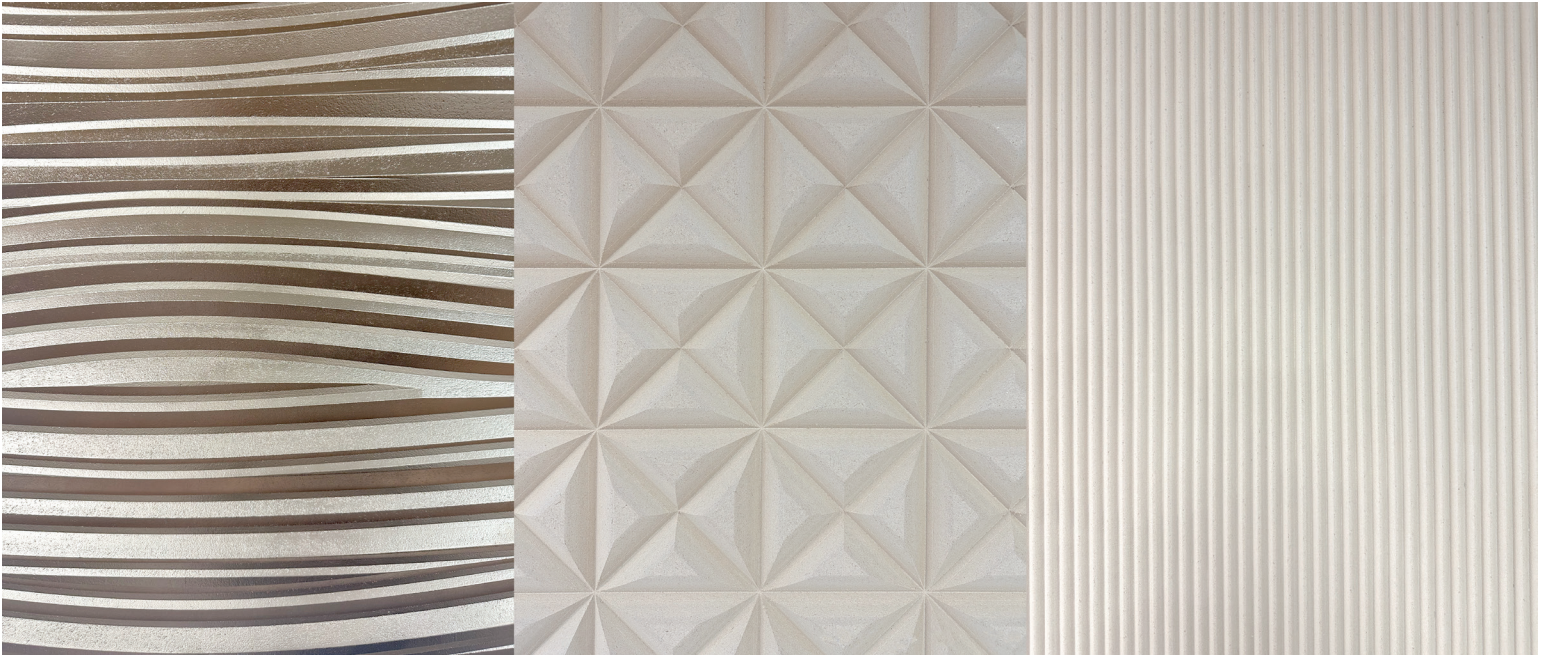
Custom CNC Wall Panels: Metallic Gold Ocean Wave, Diamond 3D, and Beaded Panel.