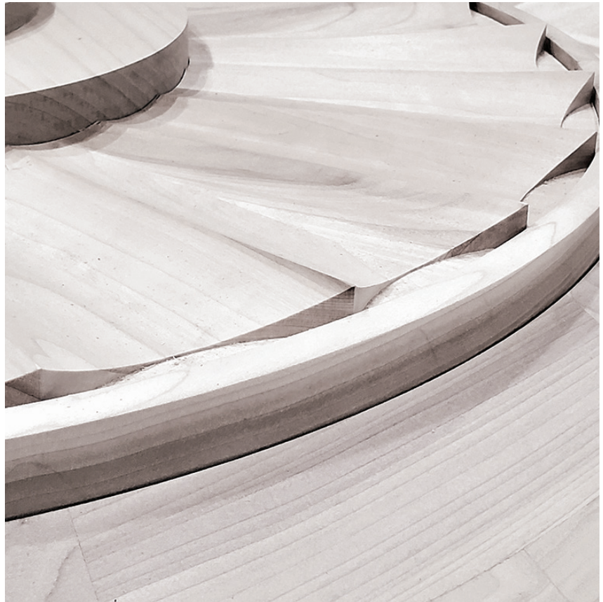
CNC Stain-Grade Fluted Medallion

Whether you're envisioning elegant arches, graceful ovals, intricate ceiling details, custom cuts from our extensive sheet inventory, custom wall panels, corbels, or radius wood crown molding, we have the state-of-the-art technology, experience, and expertise to make it happen.