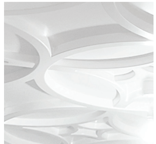
CNC Machined Ceiling Detail