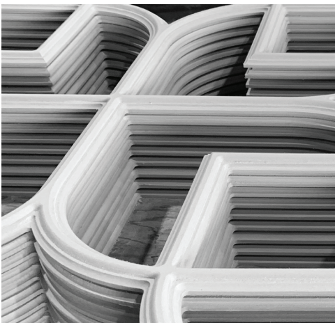
Mass CNC Production